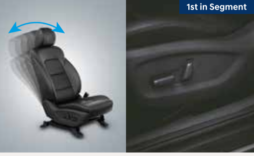
10-way Power Adjustable Driver & 8-way Power Adjustable Passenger Seat