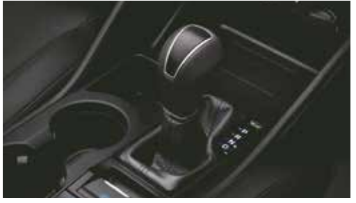
8-speed AT (Diesel only)