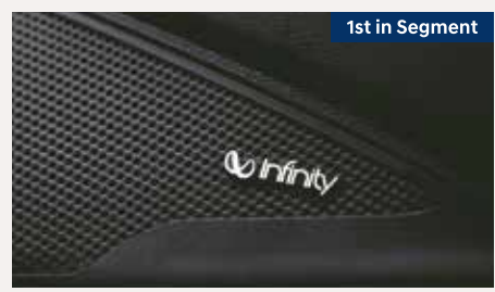
Infinity Premium Sound System (8 Speakers)

Apple CarPlay | Android Auto | Onboard Navigation | Voice Recognition Hyundai iBlue (Audio Remote Application)