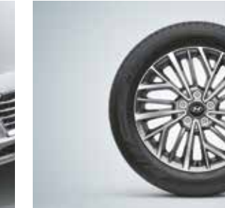
R18 Diamond-cut Alloy Wheels