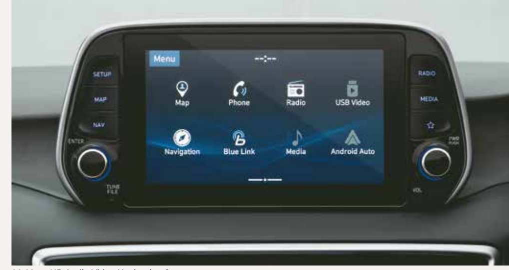
20.32cm HD Audio Video Navigation System