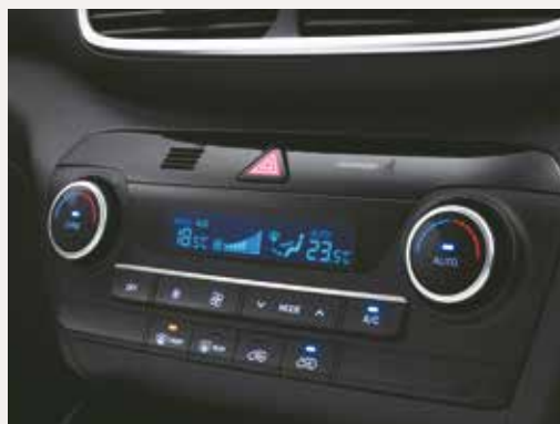
Dual Zone FATC with Auto Defogger