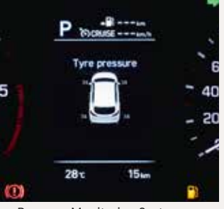
Tyre Pressure Monitoring System (TPMS) with Display on Cluster