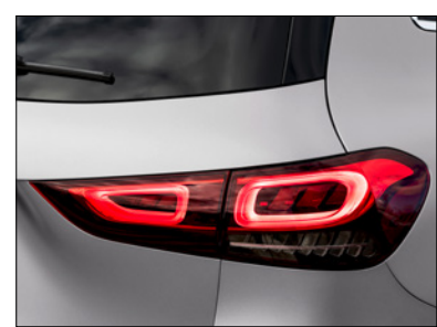
Impressive new tail lights