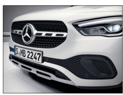
Sportier grille design