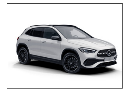
Distinctive Longer Wheelbase