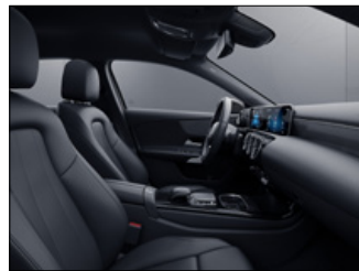
ARTICO man-made leather black