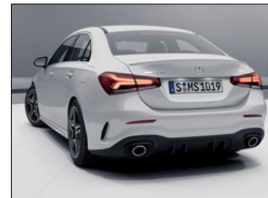
Incredible back profile