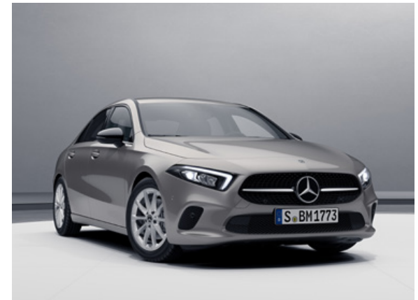
Exceptional front profile