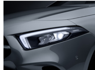
LED High Performance headlamps

One good look at the A-Class Limousine and temptations are bound to take over. Its exemplary design steals attention no matter what angle you look at it from. The new A-Class Limousine sets new benchmarks in design and obsession.