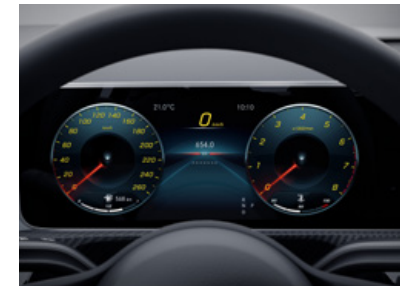
All-digital instrument display