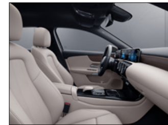
ARTICO man-made leather macchiato beige