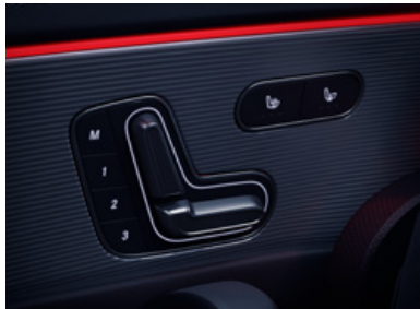
Memory function with electrically adjustable seats