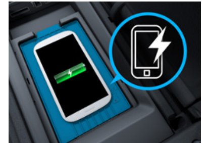
Wireless charging system