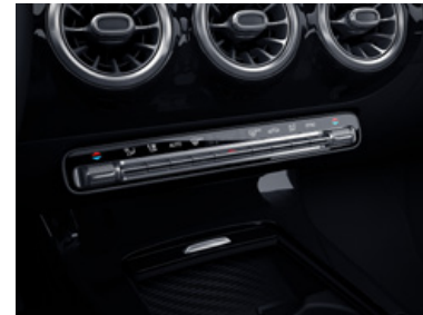
THERMOTRONIC 2-zone automatic climate control