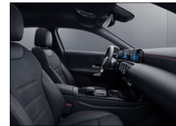
DINAMICA microfibre black (Mercedes-AMG A-Class)