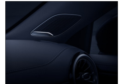
Burmester® surround sound system