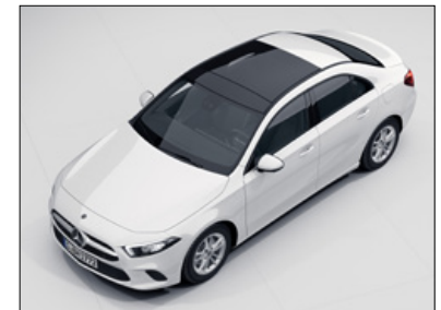
Panoramic sliding sunroof