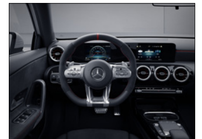
Multifunction sports steering wheel in nappa leather