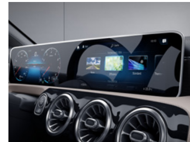
Media display with Touchscreen