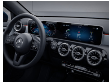
MBUX with NTG 6

Luxury that indulges your senses and technology that assists you in every way. Made with the finest of materials and promising craftsmanship, this is the interior of the A-Class Limousine.