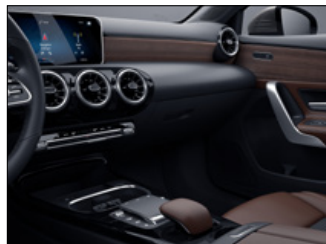
Brown open-pore walnut wood trim