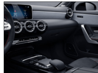
Light longitudinal-grain aluminium trim (Mercedes-AMG A-Class)