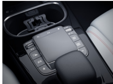
Touchpad without Controller