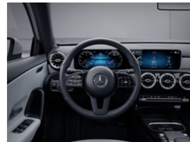
Leather multifunction sports steering wheel