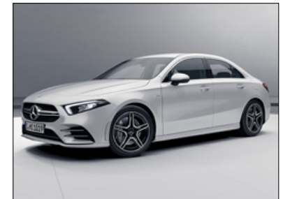
Impressive front profile