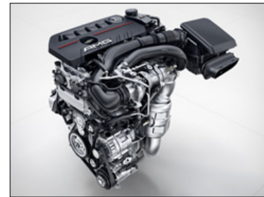
AMG powerful engine

Feel the world blur around you as you experience the heightened power of the AMG engine. With superior safety systems and an agile suspension, the A-Class Limousine is more than ready to handle your foot on the accelerator.